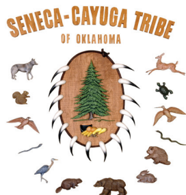
Logo of the Seneca-Cayuga Tribe of Oklahoma